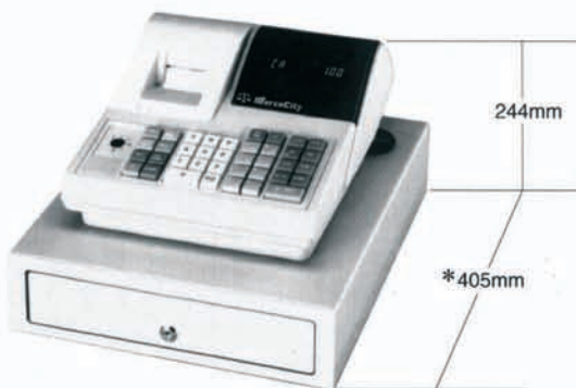
*Shown with #33 drawer